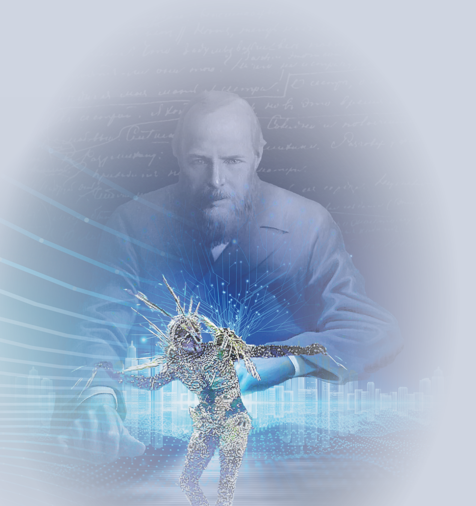
Fyodor Dostoevsky, the exponent of humanism and theanthropism, observes an abomination of transhumanism, the “Golden Voyager” humanoid at the closing of the Olympic Games in Paris in 2024.